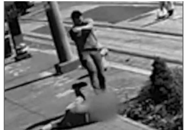
Brice kicking Crosby after pummeling him