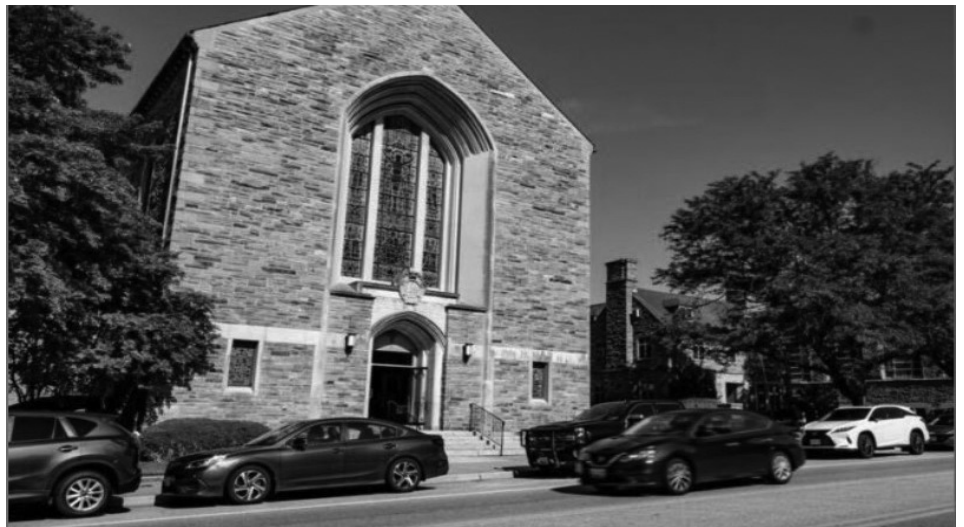
St. Mary of the Assumption-Govans set to close, from the Catholic Review