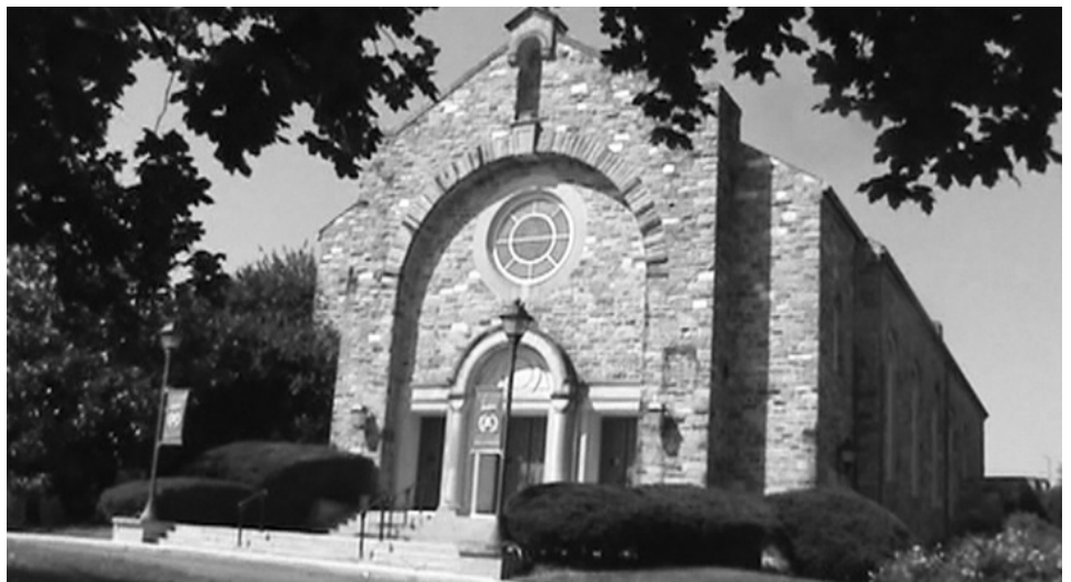
St. Pius X set to close