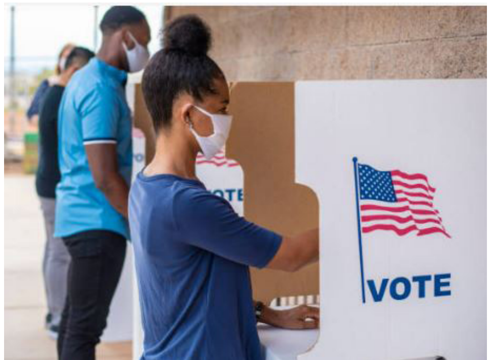
Citizens exercising their right and duty to vote

At this time, we are also facing the wearisome spectacle of Catholics stating that because both candidates from the major parties are morally tainted, that they cannot vote for either one, and thus they will either stay home on election day or vote for a third-party candidate who doesn't stand a snowball's chance in "certain warm subterra-