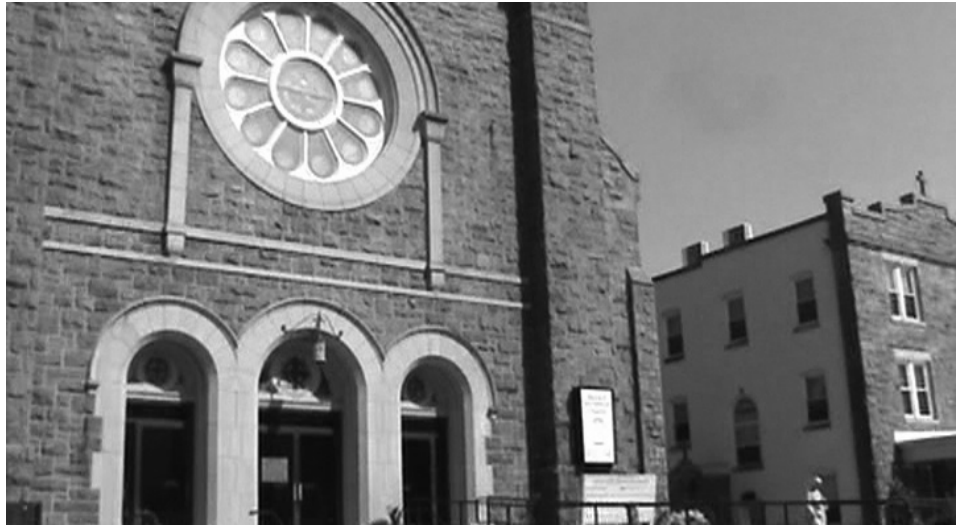
Blessed Sacrament set to close

“Section 1107 of the Bankruptcy Code places the debtor in possession in the position of a fiduciary, with the rights and powers of a chapter 11 trustee, and it requires the debtor to perform of all but the investigative functions and duties of a trustee. These duties, set forth in the Bankruptcy Code and Federal Rules of Bankruptcy Procedure, include accounting for property, examining and objecting to claims, and filing informational reports as required by the court and the U.S. trustee or bankruptcy administra-