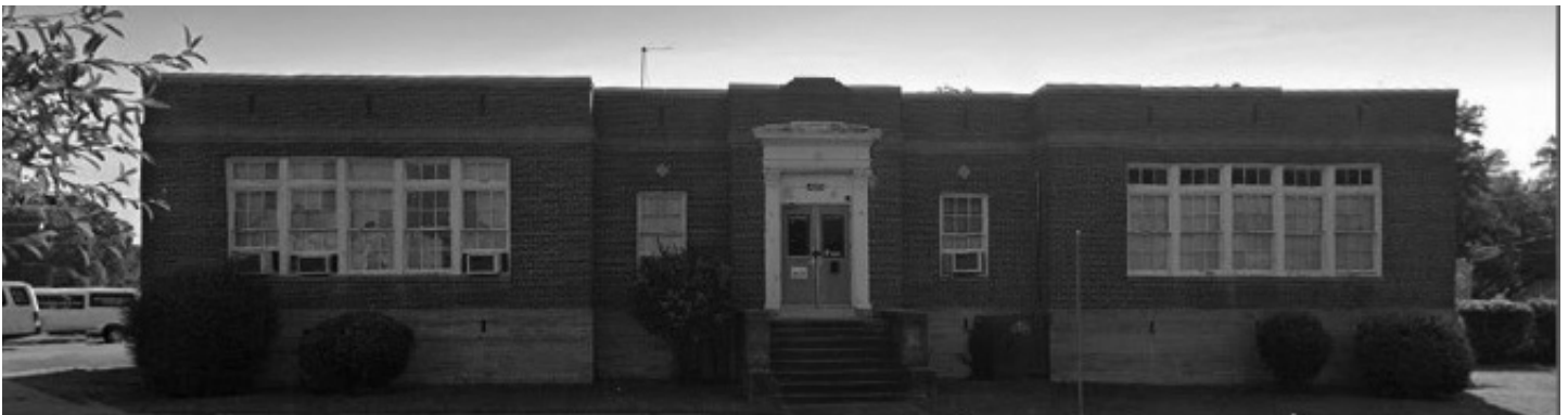
Adult Alternative Program — what will become of this helpful outreach?

We will keep the readership of Defend Life up to date with any developments.