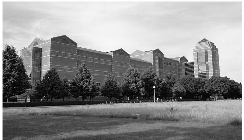
Beckman Institute, a high-tech think tank