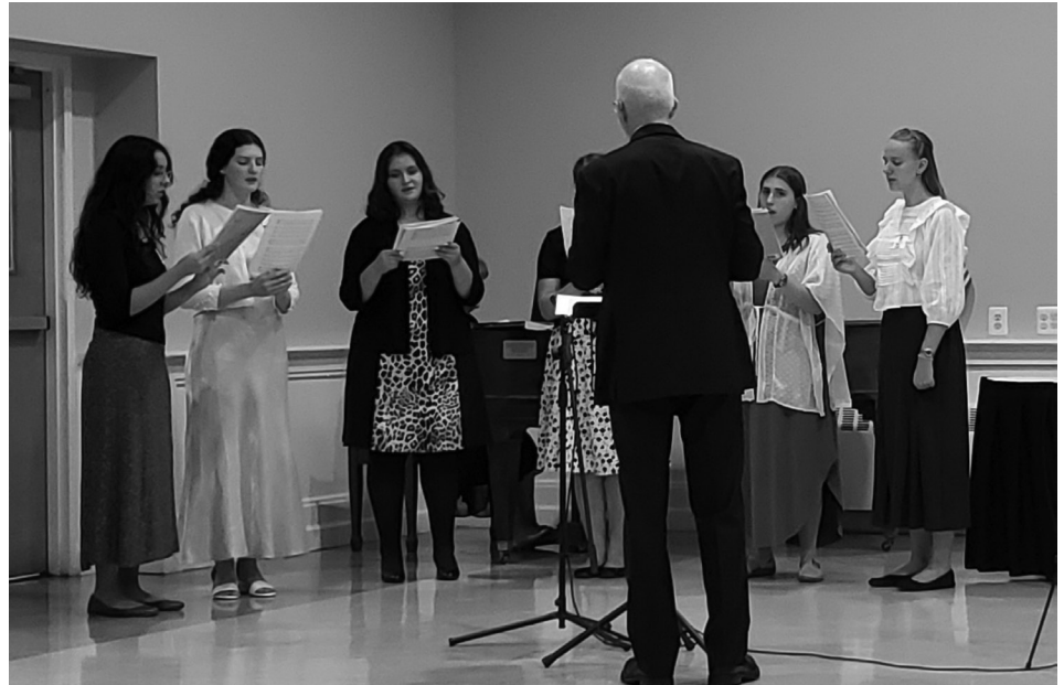
Collegium choir sings at the September gala

courses include the trivium, that is, logic, grammar and rhetoric. They involve the tools of learning: how to think, write and speak. They will learn the history of western civili-