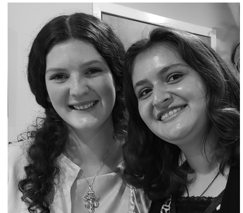
Collegium students greeting gala attendees

This writer attended a presentation of theirs on Friday September 15 th and had opportunity to chat with some of the students. I asked them what made them choose the Collegium above the other decent Catholic colleges out there (such as Christendom and Thomas Aquinas). All of these cited the emphasis on Traditional Mass and Worship, along with small class sizes.