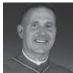
Bishop Joseph Coffey