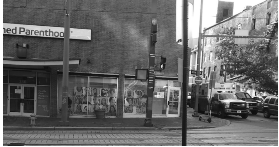
An ambulance, lights flashing, parks adjacent to the Planned Parenthood abortion facility in Baltimore.

According to the opinion, medical information about a person that appears in an ambulance dispatch record may not be disclosed in response to a PIA request, even though the record is not a "medical record."