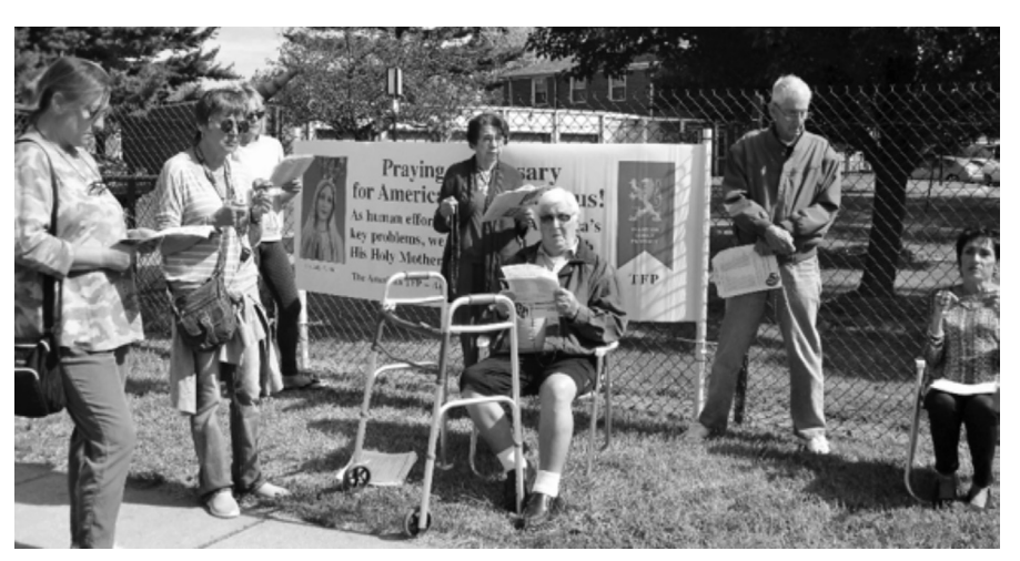
Public Square Rosary Crusade

Bring your wife, bring your girlfriend—heck, being your wife and your girlfriend—or girlfriends—the more the merrier—and remember our motto: All Are Welcome!