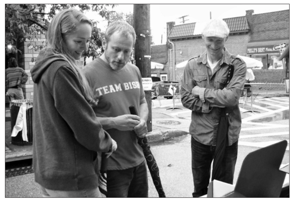
Why are these folks smiling? They've stopped to gaze at the unborn baby models on display at the Respect Life booth at Hampdenfest.

"But even with fewer stoppers, there were still some good mo-