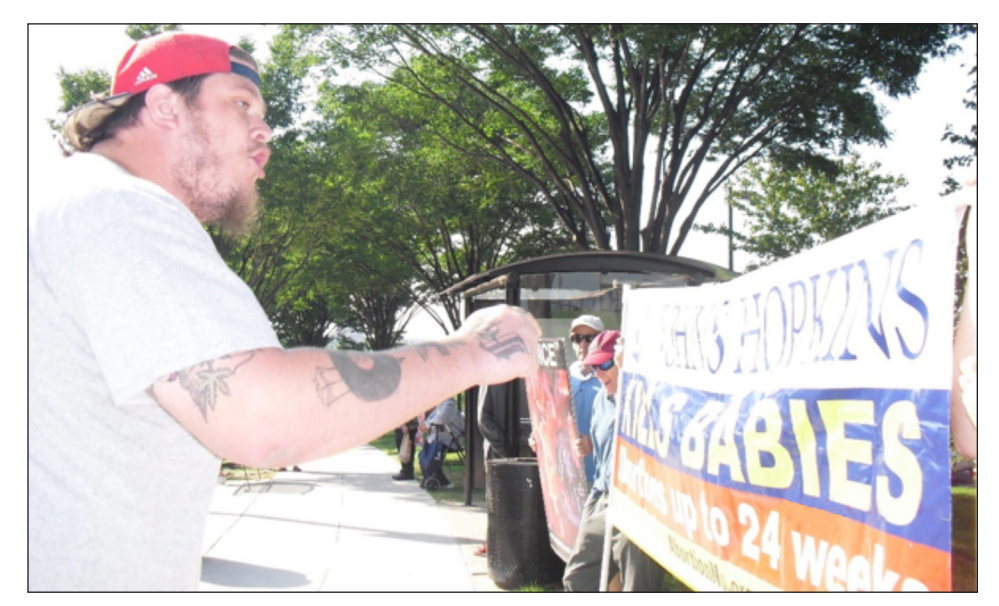
An angry passerby yells profanities at a sign holder at Defend Life's September 19 protest of abortions at Johns Hopkins Bayview.

Defend Life conducts protests against abortion at Johns Hopkins Bayview in Baltimore on the third Wednesday of each month.