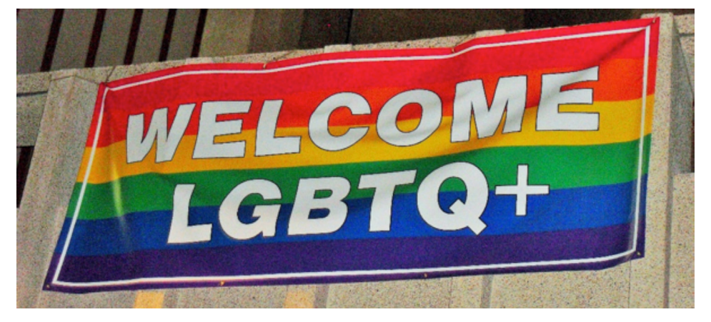
A large banner on the back wall inside St. Matthew Church welcomes lesbian, gay, bisexual, transgender and questioning people.

A marcher carries a St. Matthew Catholic Church sign in the 2018 Pride parade in Baltimore.