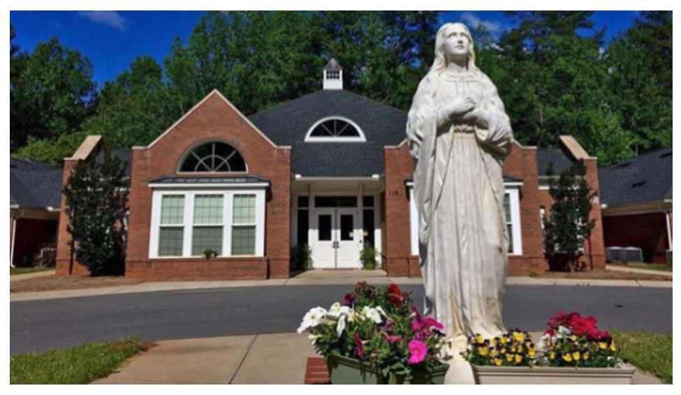
Mira Via offers pregnant college students who think they have no choice but abortion or dropping out of college an opportunity to finish their education and keep their babies.

The capital campaign for the Mira Via residence launched in