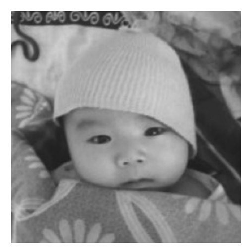
This little baby girl was rescued by Women's Rights Without Frontiers' Save the Babies campaign in China.

"Finally, they just picked her up—literally—she was a small woman, dragged her out of her home, screaming and crying, held her down to an operating table, cut her open and tied her tubes, all without anesthesia. She said that the pain was unimaginable—like somebody had a blow torch inside of her.