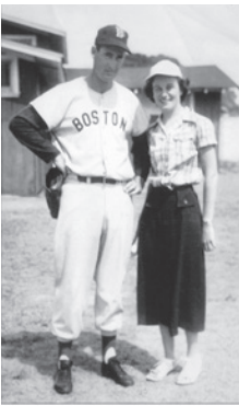
EILEEN FITZPATRICK BOLGIANO WITH HALL OF FAME SLUGGER TED WILLIAMS AT SPRING TRAINING