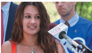
INSIDE: Defend Life marks free speech victory

Affiliate, Mater Dei Chapter, Catholic United For Faith