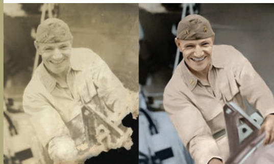
Original 2"x2" Photo badly creased and silvered

Restore your precious photos NOW before it's too late! Contact Pro-Life Mary Lou Coyle