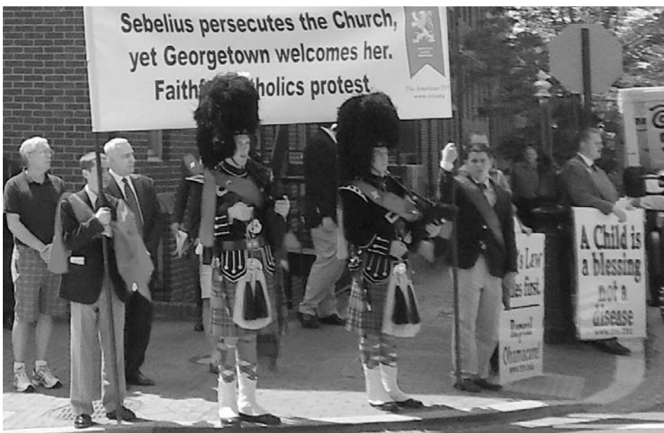
Members of the American Society for the Defense of Tradition, Family and Property protest at Georgetown University.

The men of TFP were still there. They were an impressive presence with their signature red sashes and banners. They even had bagpipe players in Scottish regalia (must have been hot under those wool hats). They were handing out literature to people who were starting