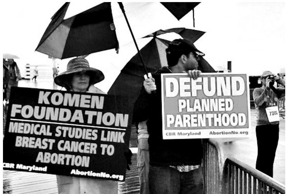
Protesters at the Komen Foundation's Race for the Cure in Ocean City, Maryland, call on Komen to stop funding Planned Parenthood.

of the management of Komen Maryland that our presence brought attention to a subject that Komen would rather go away.