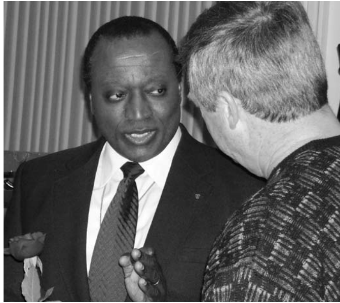
Ambassador Alan Keyes talks with a pro-lifer after his speech at American Life League's Personhood Conference.

They collected over 130,000 signatures to get it on the ballot and, al-